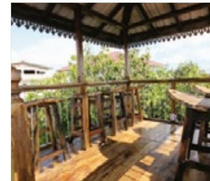
SHABA BOUTIQUE HOTEL **** Beach Resorts Zanzibar | Stone Town