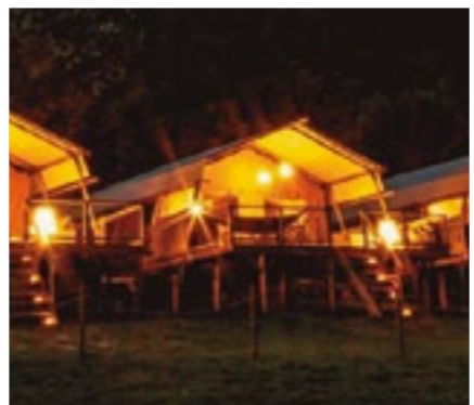
AFRICA SAFARI SERENGETI NORTH Tanzania Safari Lodges