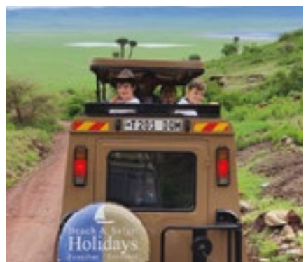
AFRICA SAFARI NGORONGORO Tanzania Safari Lodges