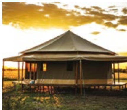
AFRICA SAFARI SERENGETI CENTRAL Tanzania Safari Lodges