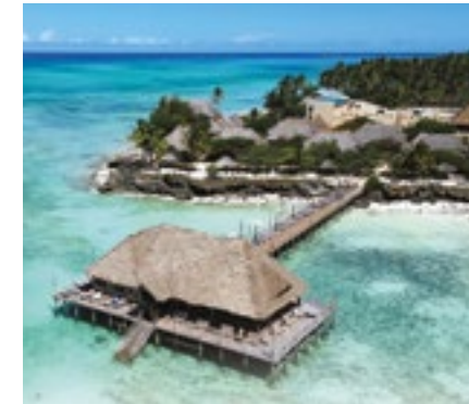
REEF & BEACH RESORT **** Beach Resorts Zanzibar | Jambiani

The island of Zanzibar is considered one of the jewels of the Indian Ocean. Visit historic Stone Town, sunbathe on one of the island's beaches or use the island as a base for a Safari to Tanzania's spectacular National Parks. We are convinced that Zanzibar is the ideal place for your holidays.