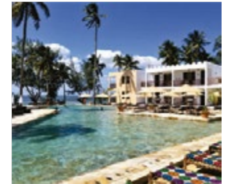
ZANZIBAR BAY RESORT **** Beach Resorts Zanzibar | Marumbi