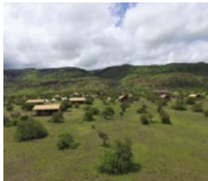
AFRICA SAFARI LAKE NATRON Tanzania Safari Lodges