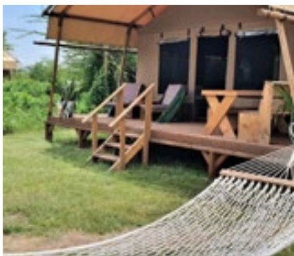
AFRICA SAFARI SERENGETI IKOMA Tanzania Safari Lodges