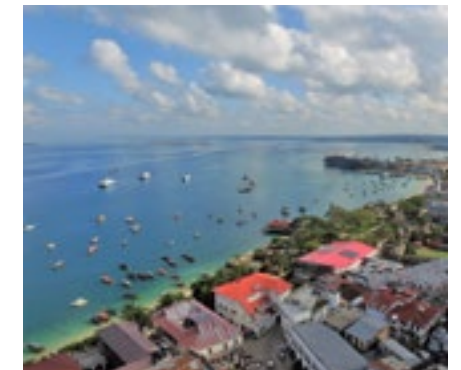
HOUSE OF SPICES *** Beach Resorts Zanzibar | Stone Town