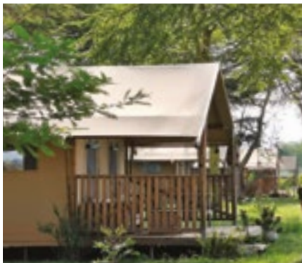
AFRICA SAFARI LAKE MANYARA Tanzania Safari Lodges

We offer you the beauty and richness of the incredible land of Tanzania - the land of Kilimanjaro, of Zanzibar and of the world-famous Safari National Parks. Our Beach Resorts and Safari Lodges will make your experience with us an unforgettable one.