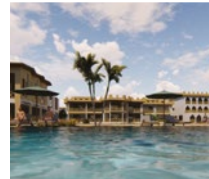
BOUTIQUE RESORT ZANZIBAR ***** Beach Resorts Zanzibar | Uroa