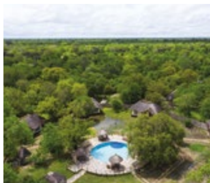
AFRICA SAFARI SELOUS Tanzania Safari Lodges