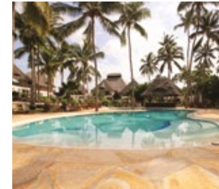
PARADISE BEACH RESORT **** Beach Resorts Zanzibar | Marumbi