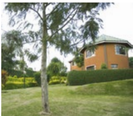
AFRICA SAFARI ARUSHA Tanzania Safari Lodges