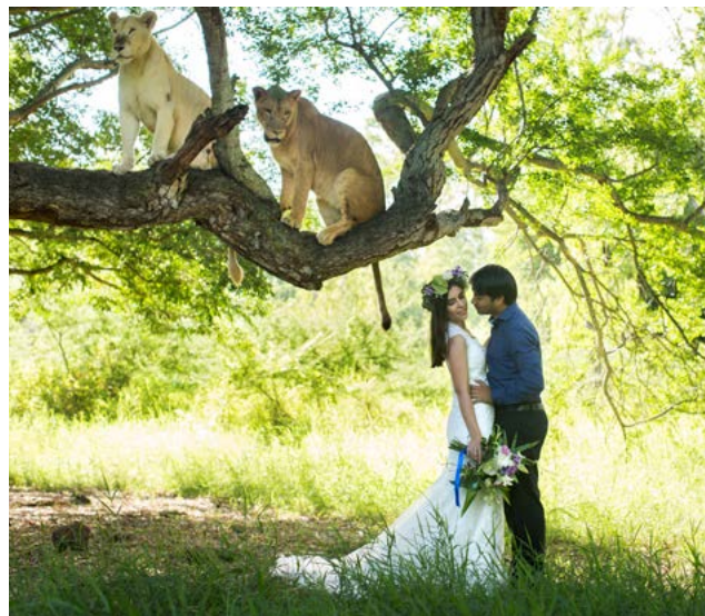
This picture is manipulated. Safety first!

Please inform us of your wishes and preferences and we will prepare your perfect wedding dinner